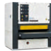
Wide Belt Sander