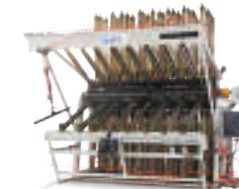
Clamp Carrier - Pneumatic