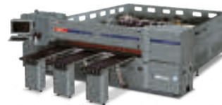
OptiCut 2.8 (Auto) - High Speed Beam Saw