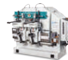
Round End Tenoner