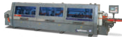
OptiEdge 6.5 P - High Speed Auto Edge Bander