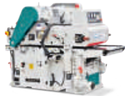
HDHQ Double Side Surface Planer