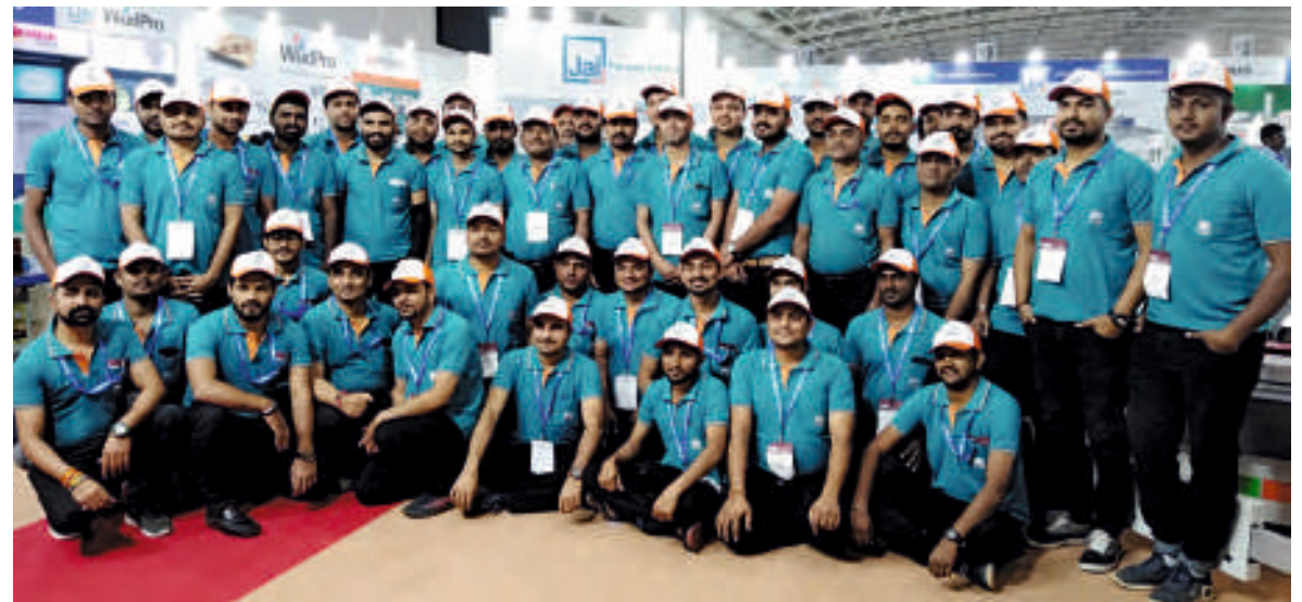
More Than 75+ On-field Service Engineers

At Jai Industries, we believe that our team is your team. We are the family that shares the same vision of delivering consistently great results for our clients, as well as ensuring the workplace stays as an inclusive, challenging place to work and develop a rewarding career.