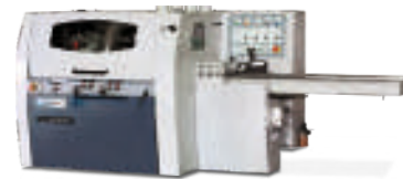
Four Side Moulder