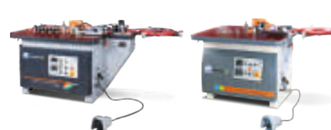
Curvilinear Edge Bander