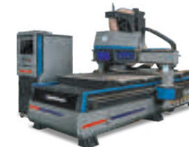
OptiRout 6.9 V - Nesting CNC Router