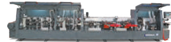
OptiEdge 8.5 - High Speed Auto Edge Bander | Specialized 45° Edge Bander