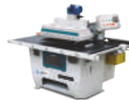
Straight Line Rip Saw