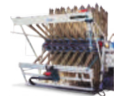
Clamp Carrier - Hydraulic