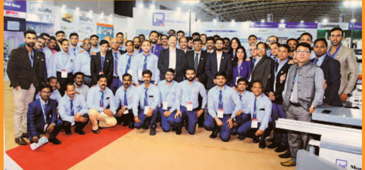
Largest Sales Team

At Jai Industries, we believe that our team is your team. We are the family that shares the same vision of delivering consistently great results for our clients, as well as ensuring the workplace stays as an inclusive, challenging place to work and develop a rewarding career.