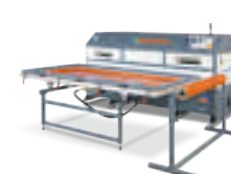
Vacuum Membrane Press (Compact)