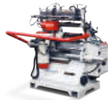
Dovetailer - Auto