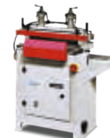
Dovetailer - Manual