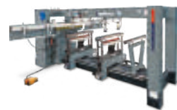
OptiDrill 2.3 - Three Head Boring