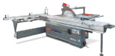
OptiSaw 3.2 - Panel Saw