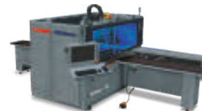
OptiBore 6.12 - 6 Side CNC Boring