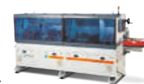
Auto Edge Bander